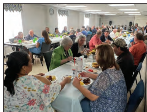
We enjoyed fellowship with one another around the dinner table.