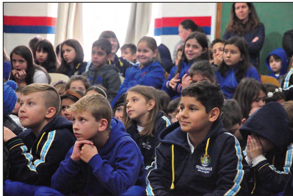
Children hearing the Gospel in a public school

We thank the Lord for both of you and how He has used you to impact so many lives for eternity in Brazil and beyond!