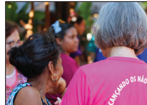
Ministering among the Tupi-Guarani Indians in Argentina

"They needed someone to tell them that Jesus loved them and gave His life for them."