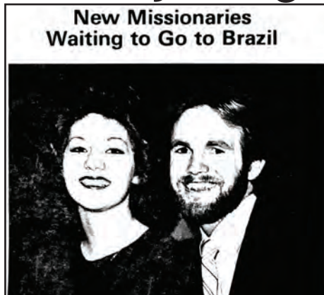
New Missionaries Waiting to Go to Brazil