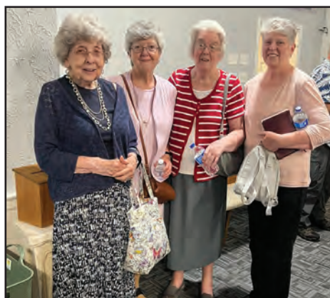
Members from Calvary in Richmond, Kentucky fellowshiping with members from New Life in Lexington.