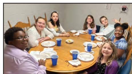
Kids having fun together.