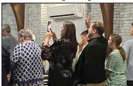
Worshipping the Lord together in song!