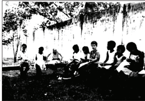
Some of the children present for Bible club in Cuiaba, Brazil (1984)