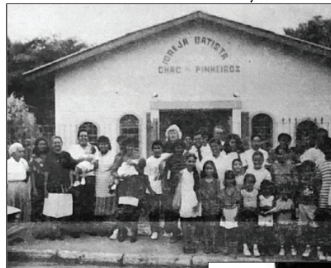
Sunday Morning Crowd at Chacara Dos Pinheiros, Cuiaba, Brazil (1994)

We are presently pastoring Faith Baptist Church in Paducah, KY. We are both 80 years old now and slowing down just a little. We're ready to go to Glory when the Master calls.”