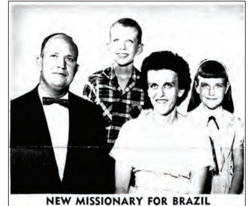
NEW MISSIONARY FOR BRAZIL The Creiglows - 1960