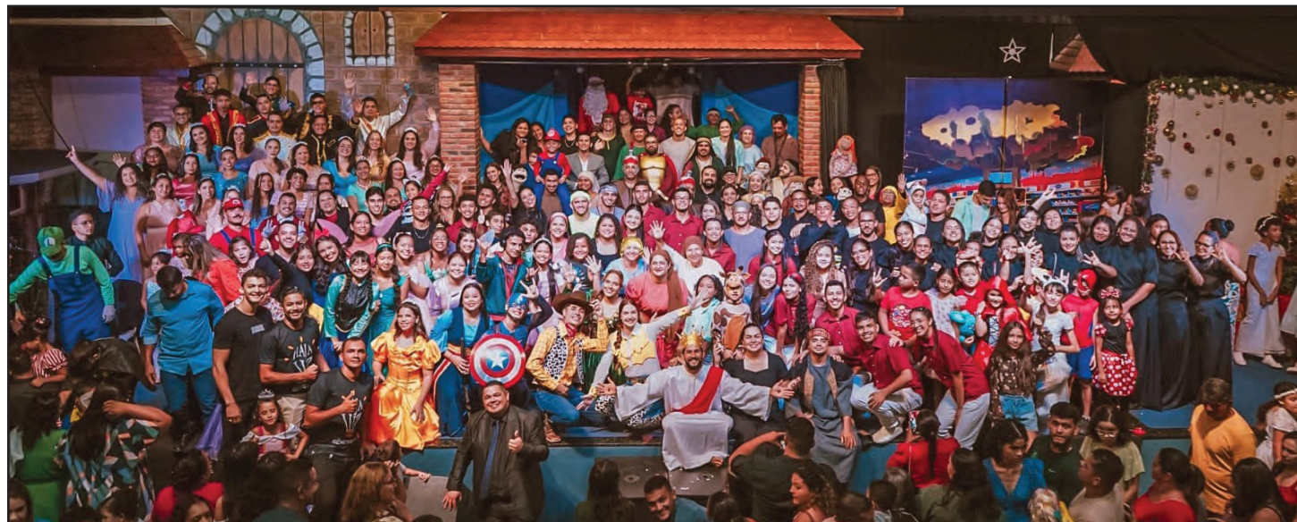
A few of the people involved in the Christmas Musical. This is just the choirs and actors, but there are also all the people backstage and support groups who welcome visitors and handle traffic, etc.

struction cycle and even starting some new building projects. There is still much to be done on our buildings, inside and out. We are also putting in a deep well at church. There are times that city water can't keep us supplied. Water and electricity have always been a problem here in Cruzeiro do Sul. We are also doing some building at camp Salém.