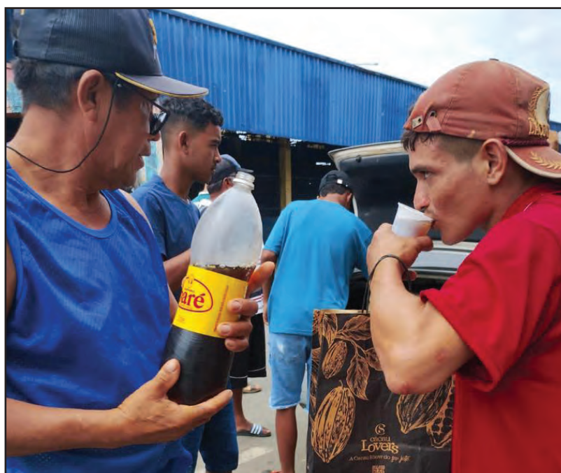
Serving leftovers to street people in Manaus

We have started the next building at the camp. With this being rainy season, things are a little slower. Also, we plan on getting back to the church of Cacaú. There we need to raise the floor. We have to take quite a few truckloads of dirt, then spread it out so we can concrete it. With the rain,