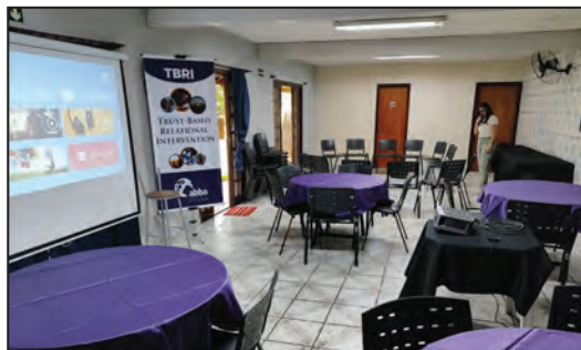
Raquel preparing the room to equip childcare givers in a TBRI training seminar

View more pictures on our FaithWorks Blog at www.bfmnow.org .