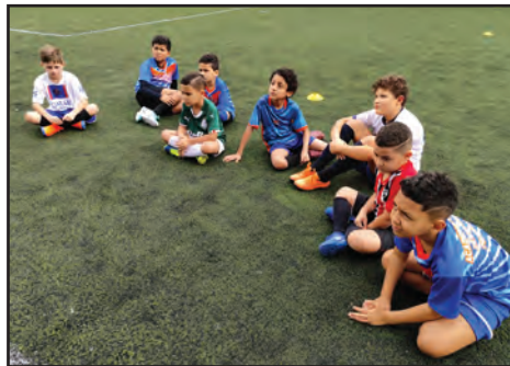
Lesson in Proverbs 3:31