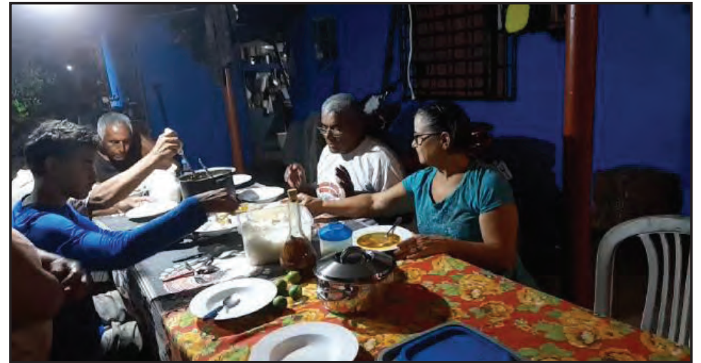
Sharing a meal together before Bible Study

Pray with us that the Lord would open more homes for services.