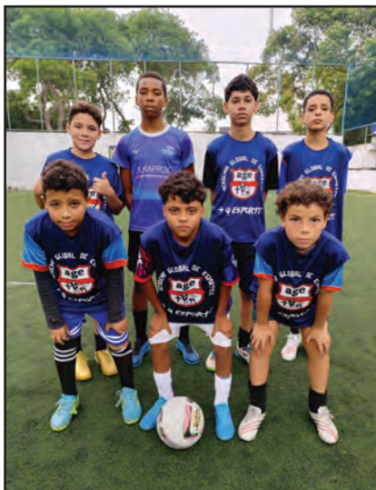
Our middle school group