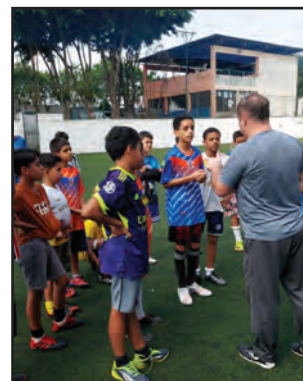
Checking on memory verse