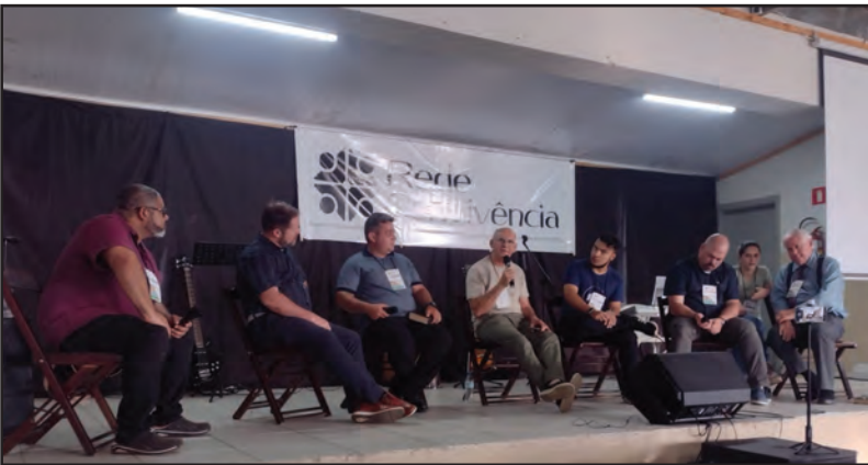
Pastor's Panel Discussion