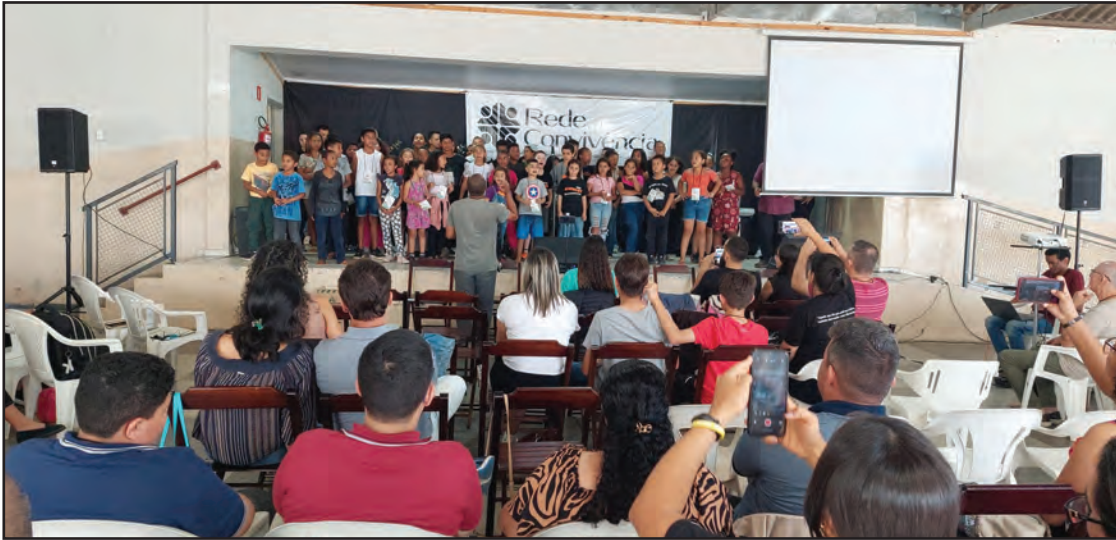
Children's presentation at the conference