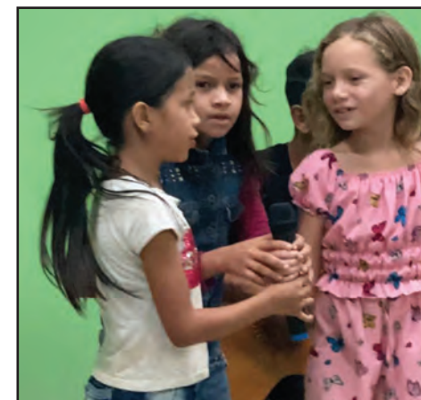
Kids from Ubim singing

"Let everything that has breath praise the Lord..." - Psalm 150:6 -