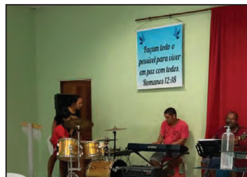
A young teen playing the drums