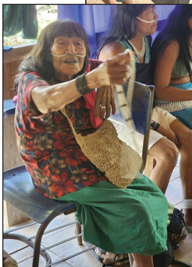
The chief's 123 year-old mother