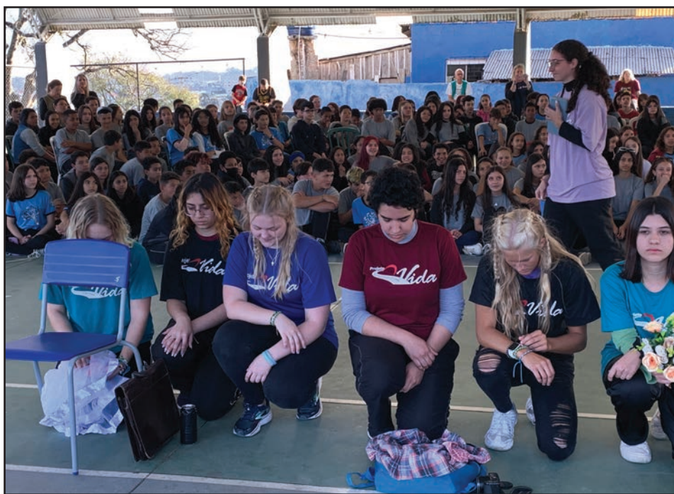
Projeto Vida Team presenting the Gospel in a public school