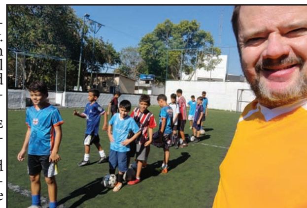
Partnering with a soccer school

Due to the increasing demand and rising expenditure on transportation,