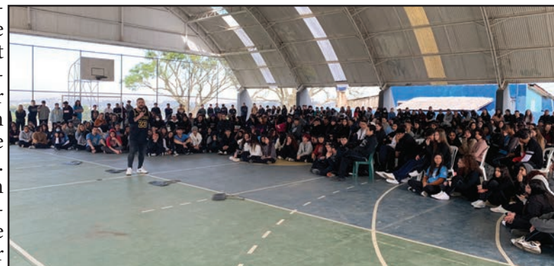
Projeto Vida Team presenting the Gospel in a public school