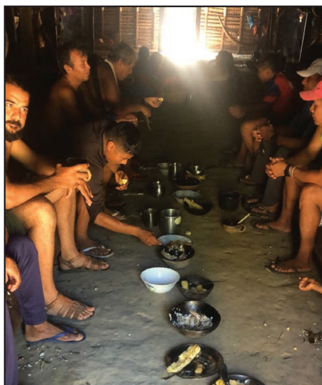
Sharing a meal with the tribe