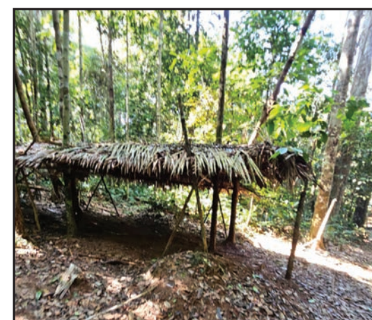
Rest area on the 26 mile walk