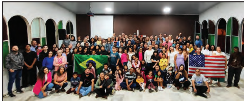
Cedar Grove & Alvaro de Carvalho Baptist Church

The fervor and devotion displayed by the Cedar Grove mission team have reignited the community. I want to express my profound appreciation for their efforts and their impact at the church and in Alvaro de Carvalho.