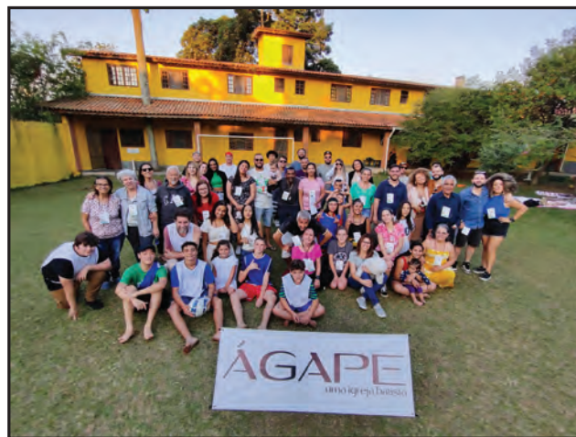
Agape Baptist Church