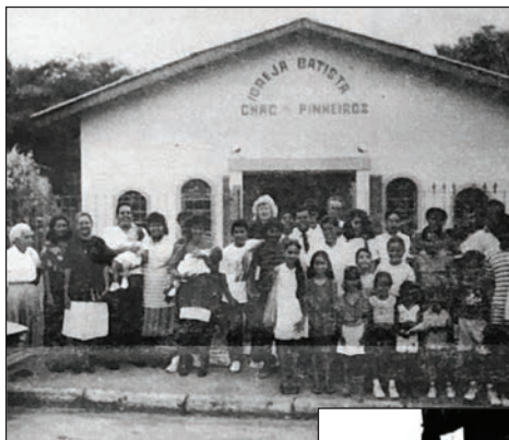
Sunday Morning Crowd at Chacara Dos Pinheiros, Cuiaba, Brazil (1994)

270-628-9517 / home | 270-562-0828 / cell hmdubdbr@yahoo.com