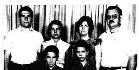
The Turner Family - 1983