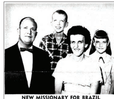
NEW MISSIONARY FOR BRAZIL The Creiglows - 1960