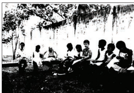
Some of the children present for Bible club in Cuiaba, Brazil (1984)

came to continue the building of the church until they returned. A building was constructed shortly thereafter. Richard also ministered and preached to the lepers in their own church located in the leper colony.