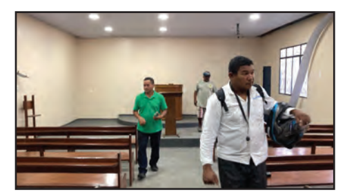
The inside of the church they plan to buy at the village of Ariau