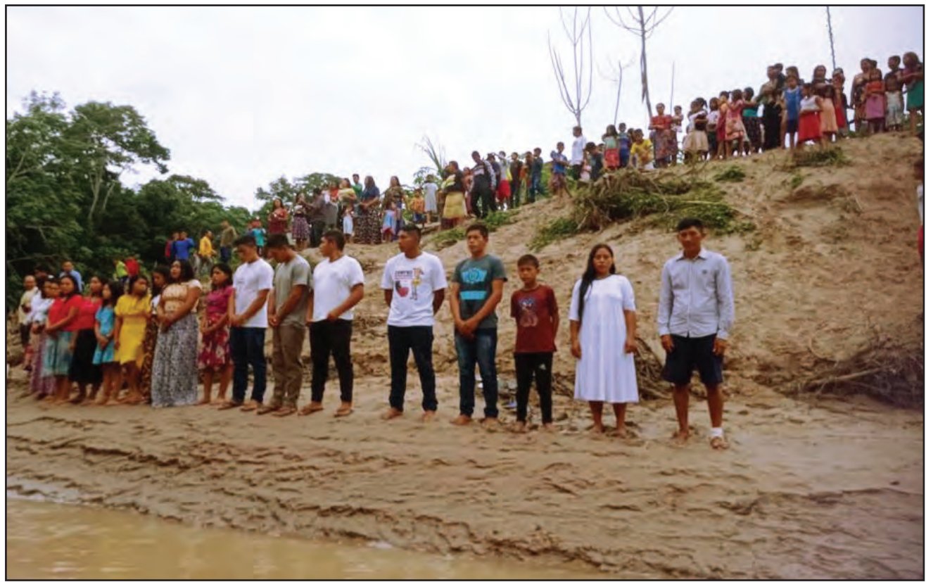
Gathering for baptism at the Breu River