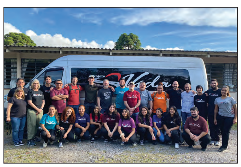
Team of 8 volunteer evangelists from Virginia with the Projeto Vida Team

Christ. They will be with us for 6 days of intensive outreach to over 4000 people outside of the church building. Mostly non-believers, for now, but we hope that many will be saved in these next few days of outreach.