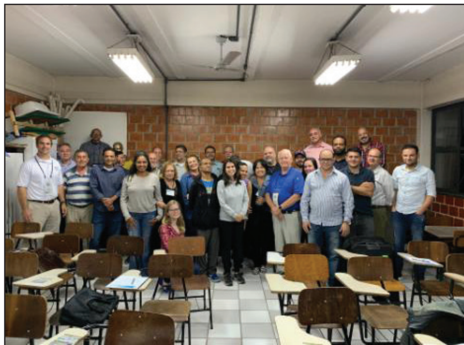
Seminary Class Participants