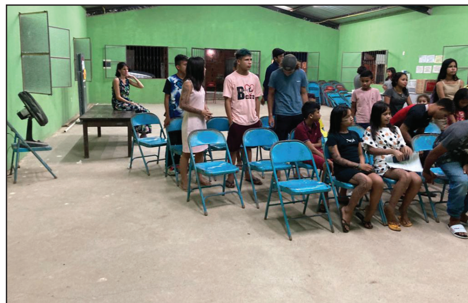
The floor of the Church in Ubim