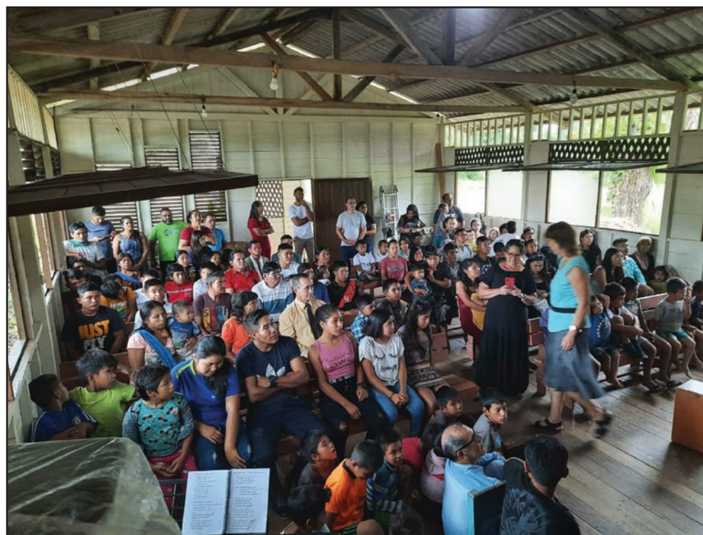
Packed Church Building

doctor visits and procedures along the way.