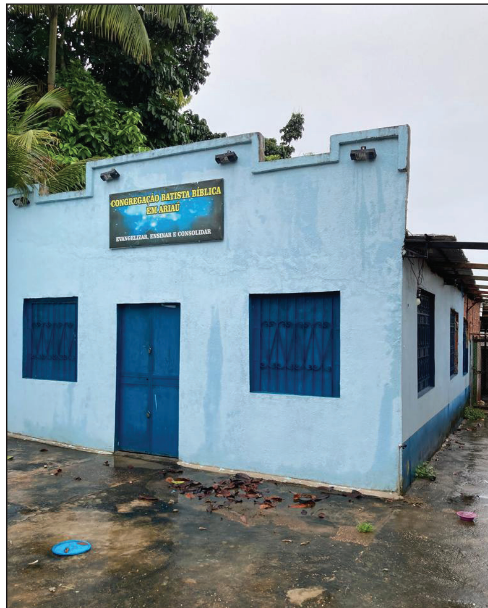
The building they want to purchase