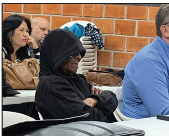
A blind man participating in the seminary class

I want to tell you about one more miracle. Our Brazilian son (of the heart), a child of the street, will be starting his veterinarian practice and his ambition is to use his knowledge to serve the Lord in India or Africa. Pray for him to be able to get a visa to