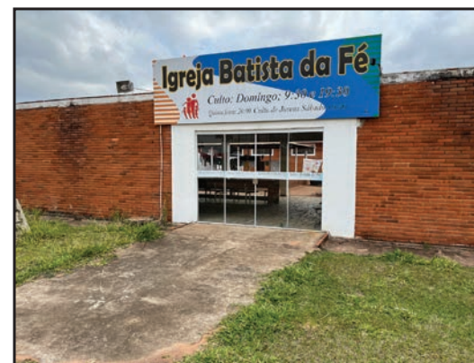
Igreja Batista da Fé