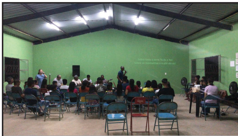
Saturday Night Service in Ubim

View more pictures online! bfmnow.org/faith-works-blog