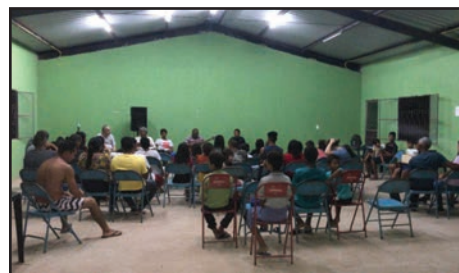
Saturday Night Service in Ubim