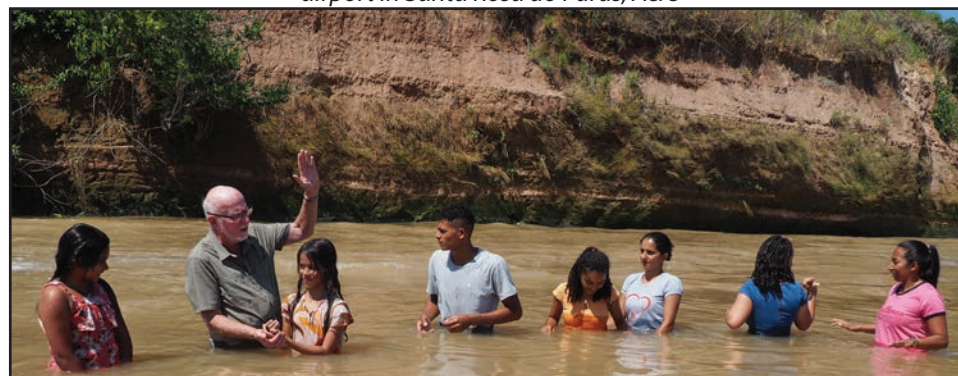
Baptizing 7 people in the Tarauacá River

support. God bless you as much as He has us.