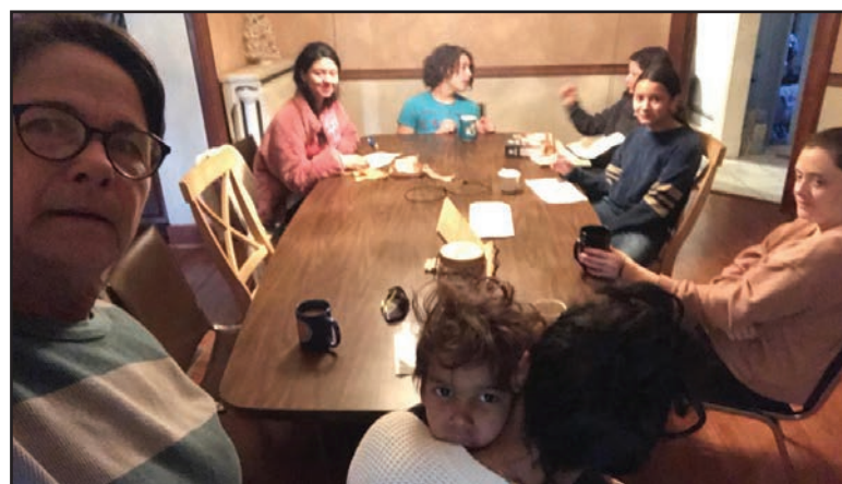
Time with Grandkids