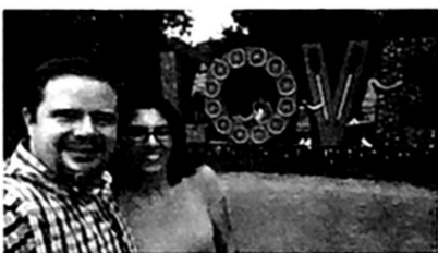
A casual family picture of the Hatchers