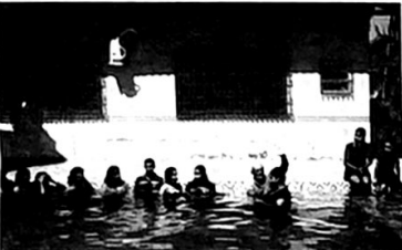
Baptism at Guajará in the state of Amazonas