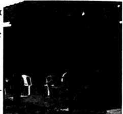
Running out of space and seating for Sunday School.