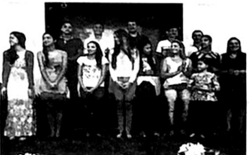
The most recent group that was baptized into First Baptist Church, Cruzeiro do Sul, Acre, Brazil.