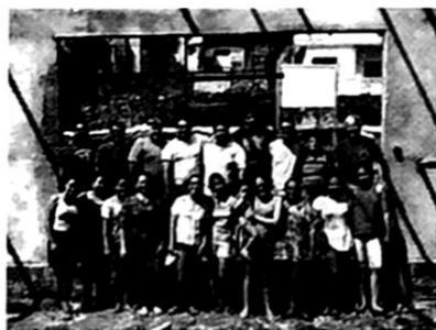
Team Centro in front of the construction of a new church building downtown

There is an update on the new church plant in downtown Manaus that I mentioned in a previous edition. At the time I wrote, the team was planning and praying for the building permit to be issued. The building permit was issued and building began immediately. As they get the building ready they are meeting at another location. On the Mother's Day Sunday service five people made public professions of faith in Jesus