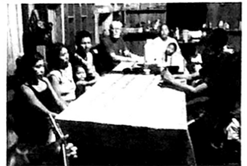
Bible study with five nationalities in Tipisca, Peru (Brazilians, Peruvians, Caxinauá, Ashaninka and one American)

Zico and I travelled 970Km (606 miles) during our 9 day trip. We got to visit 4 of our missionaries in 4 locations. We were able to share the gospel to people of 5 different languages. One person was saved. We didn't get rained on. Not a single drop. Even though the river was dropping so fast (7 feet one day) we didn't have to even take off our sandals one day. I can't remember the last time when I made this kind of trip that I didn't have to wade through all kinds of mud. We were in the