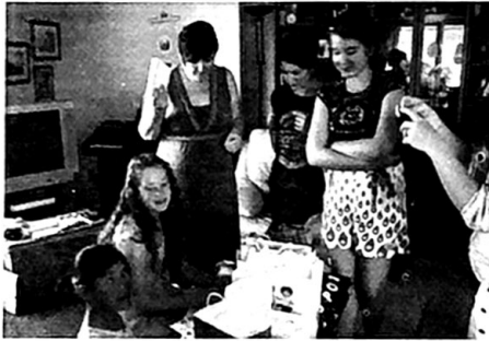
A baby shower was given for a believer in Tournefeuille who just gave birth to a baby girl.

There have been new people on a regular basis in our various meetings