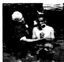
Baptism in Manaus