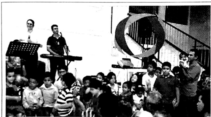
Kids at church