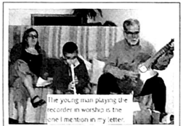
The young man playing the recorder in worship is the one I mention in my letter.

Last week, just before our Bible study in Mazere started we heard about an incident that illustrates the hatred of human behavior. A young man about twelve years old who comes to this meeting had been threatened with death by a schoolmate because he represents "the other side." His mother was quite worried about the safety of her son. Last night, I heard a wonderful ending to this story. In this Bible study we are studying the Sermon on the Mount. The