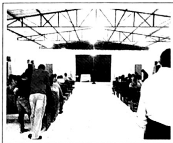
The church where the children are helping taking them to seminars and doing training in the church activities. Pray for them and for us as we put this in action.

and Sunday School. It has been great to see these ministries growing. The members that are there have had very little training. We want to help them in this area also by