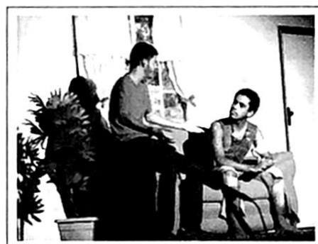
A teen off the street hearing the story of Christ from his saved friend

motorized rotating section on one end of the stage, special lighting, sound and all the props. Practice starts in the middle of the year. It is a lot of hard work. The thing is that we get the gospel to hundreds of folks who have never really heard. Now some of these are very religious folks (priests and nuns) and know the story of Christ's birth,