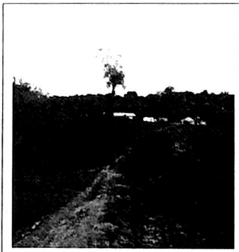
Their new home in the Amazon

In Garça, things are doing great. The church I pastored that meets at the Alpha