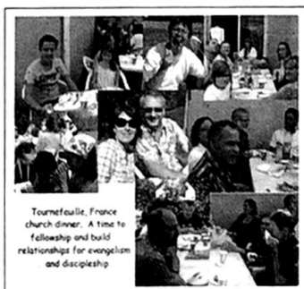
Tournefeuille, France Church dinner. A time to fellowship and build relationships for evangelism and discipleship