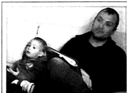
A father and son that are regular attenders on Sunday mornings in Tournefeuille