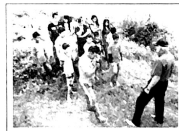
Giving instructions to fourteen candidates just before baptisms at mountains of Moa River.