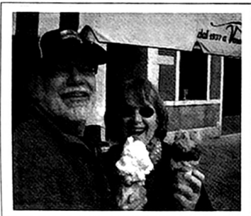
Celebrating 41 years ministering together.