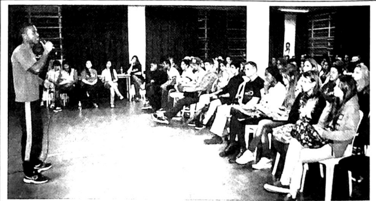
A gospel message shared in a public school