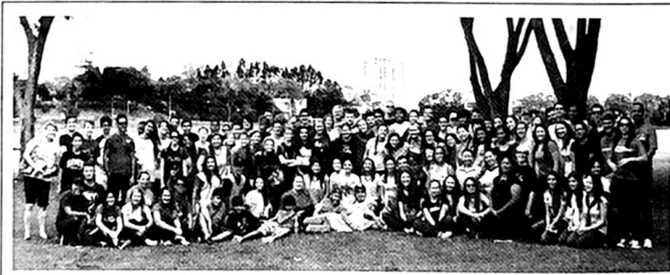
The youth group from Brandon, Florida with translators and Projeto Vida in the public park