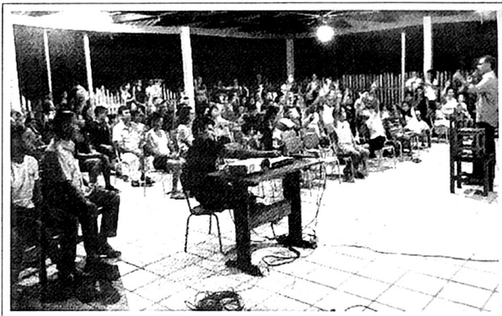
First service held by a Baptist church in the town of Jordão, Acre.