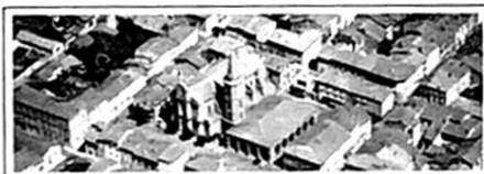
City of Mazere - We have Bible study near upper right hand corner.