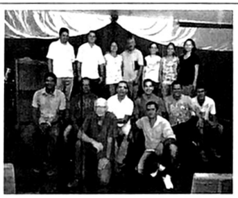
Medical missions team

whatever ready at each step of the process. I don't speak much Spanish, but we got along just fine. We even had some good laughs. He was with me for at least ten hours every day for four days. At the end of each day we would clean up the building; sweeping and mopping (on hands and knees). After all that he would still ask in Spanish, of course, "Quieres ayuda, Pastor?" "Do you need help with anything else, pastor?" Wow! What a worker. We made ten mahogany pews in four days. They are sanded and ready for varnish. Each night we had a few more seats for the services.