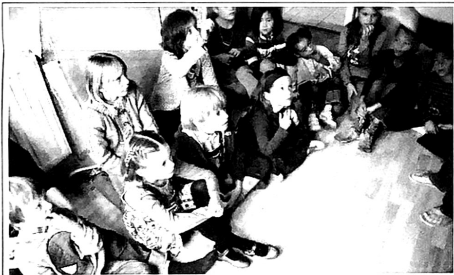
Children's class at Tournefeuille.