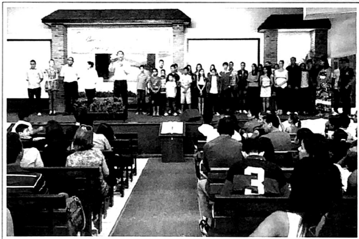
Latest happenings in Cruzeiro do Sul, Brazil.