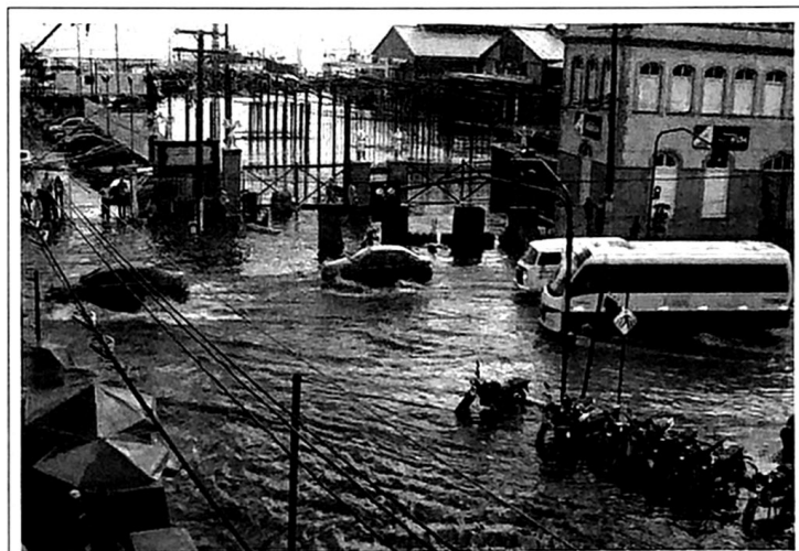
The flooding in Manaus.