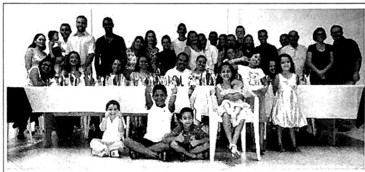
New church plant's first service.