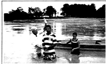
Couple baptized at Foz do Breu.

We visited our congregations at Pe da Serra and Republica. Both are doing well. Pe da Serra is steady in attendance, but we don't expect growth as it is inside the national park. The federal government is trying to get everybody to move out. Nevertheless, the folks there have put up a new building. We helped them with our standard floor plans, design and the roofing. It is almost finished. In fact, the day we arrived I got straight out of the boat and went to work with them on the building. We held services every night and worked on the building during the days. Our visit at Republica was brief. This work is in the Nukini indian reservation, so growth there is slow and limited, too. Our pastor there is Aldenizio. He is twenty-five years old and just graduated from high school. The tribe wanted him to be principle of the school, but he felt that it would interfere with his ministry, so he declined. He made a wise decision. The cultural and political pressures would have been huge. The day with left the reservation, headed for home, we got caught in one of our all day tropical rains. We were in my little jon boat with 20HP outboard. It was over five hours of COLD rain. We survived, though and just a