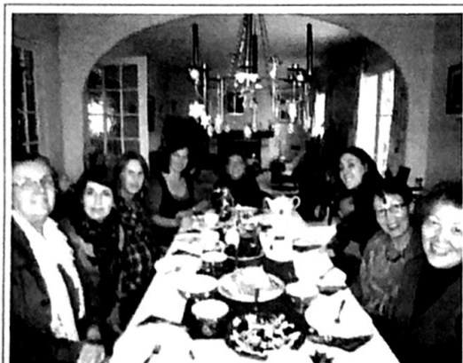
Ladies fellowship of Tournefeuille Church.