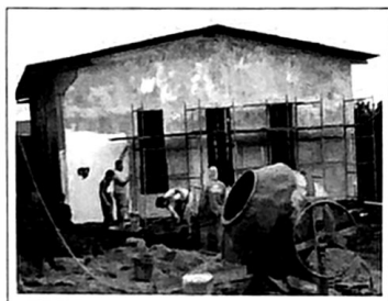
Front view of building almost finished

The Chapada Baptist Church presented for twenty-two days a Special Drama starting with Creation and ending with the resurrection of Jesus. During the presentations over 50,000 persons attended the event and 2,523 persons made professions of faith in Christ. The largest TV in Brazil gave them a three minute coverage on national TV. There is a follow up on those who trusted Christ as Savior. Rejoice with us as we begin the year of 2012.