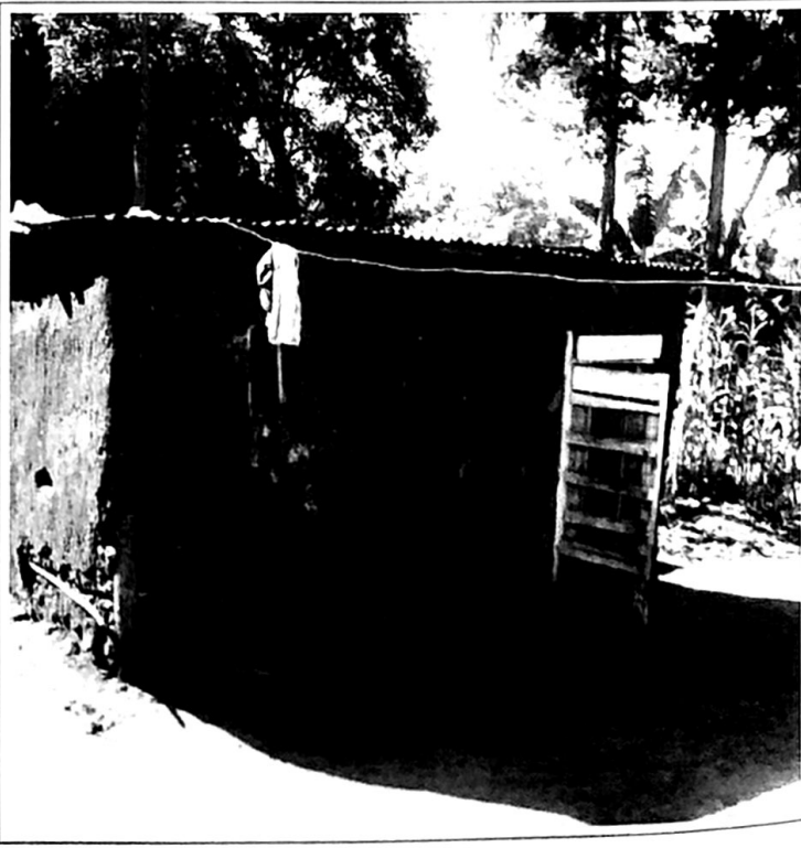
Group meeting place.