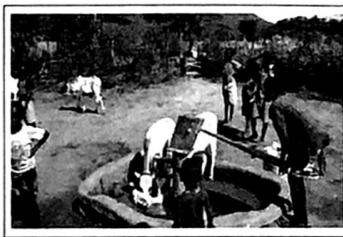
A local well was drilled so that the people could have access to some water.