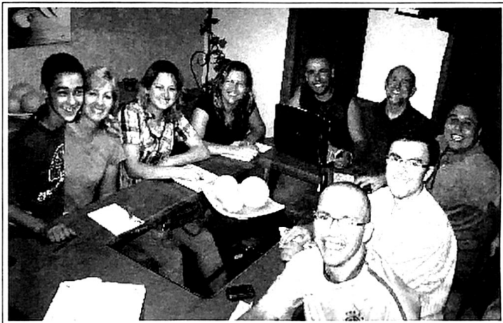
Our entire church-planting team.