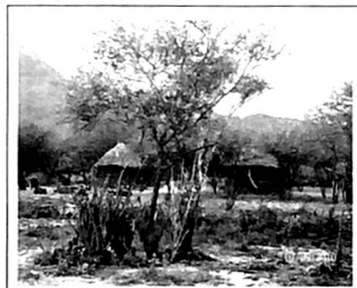
A Pokot village