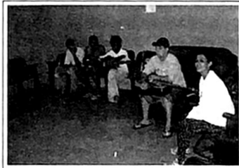
The very first day of class

We had hot dogs, popcorn, cotton candy and fresh juice for every one. Of course that always goes over well. Eating is everyone's favorite hobby. Before the hunt we gathered every one to give the instructions on how the hunt was going to be. But before we did that, we sang some songs and then the youth did a drama of the prodigal son and I shared the gospel with all those there.