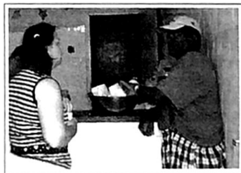
Good time clowning around

On that day we had several adults to come with their children. After all that was finished those from church and those who live here with us at Alpha and Omega played some ball and just had a great time of fellowship. It was a great day and God gave us an absolutely gorgeous day. The weather could have not been better. Enjoy the pictures. I even got dressed as a clown.