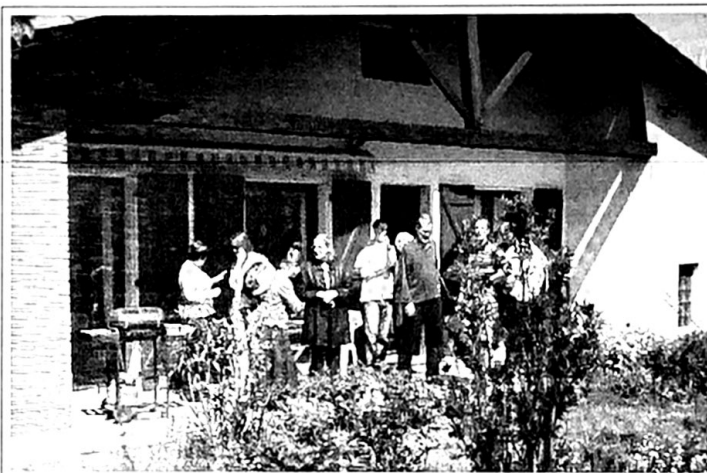
Three generations of missionaries in two continents