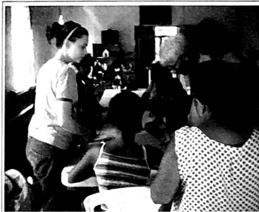
Tuesday special Bible School in Olaria