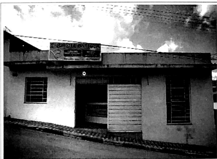
The work at Salesopolis.