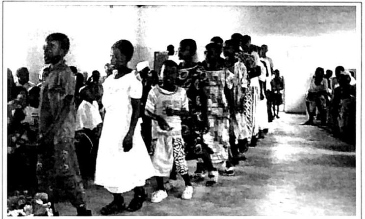
Children's choir entering the church and walking to the front to sing