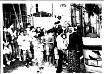
Children catching the bus for church services.

The other widow that we are helping has six kids and was evicted from a home that she thought was hers, but when her