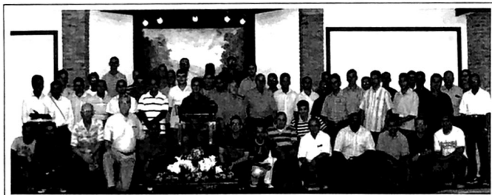
Attendees at our men's meeting.

As you saw in last month's Mission Sheets we have made the decision to end (Please See Draper Page Four)