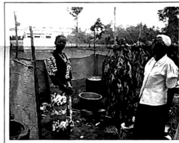
Two cooks in the kitchen cooking during the dedication.

Well, we all got a big learning experience last month. When I say "we" I mean me, the pastors that I work with and their members. We had all three churches get together to have a combined meeting at the church in Wananchi. The purpose was to dedicate the new building to the ministry of the Lord (I was able to cram about twenty-four people into my car and help them get there. That was fun!). Anyway, everything was going along just fine. The church was full of people, beans and rice were cooking in a big pot out back and everyone was having a good time. After two full hours of congregational singing, introductions, testimonies and choir singing the guest