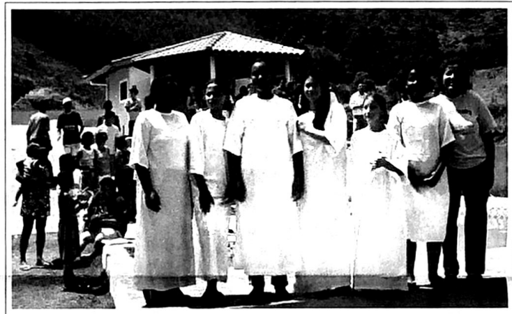
Six young people waiting to be baptized.

We are planning a work trip to Salesopolis to build Sunday School rooms in the mission there. These trips to the mission points are helping our members see the work first hand and gives them a bigger heart for missions. We are praying for another point in a city about 1-1/2 hours