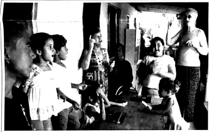
Saturday Bible School at Pereque

We are reestablishing the bus ministry and the children are anxious to get back to Sunday School. We would like to take this time to thank each one of you who have helped with the purchase of that bus. We will continue to make payments on the bus monthly and it is being a blessing. I took the van in for servicing after we got the bus and after two days and $3,000, it was almost back in shape. Yes our roads and over sized loads that we put in the van caused many things to need repair. Now the S-10 needs to have the same thing done to it and I am a little bit scared about the cost. Even with preventative maintenance things wear out.