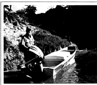
Jet drive in shallows at mountains.