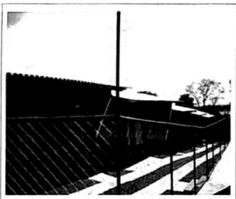
New rooms that can be used as bedrooms or classrooms.

The church purchased a bus this last week. We are now running two buses on Sunday morning. Many of the ones coming are bringing others. That is what it is all about. One thing that we are doing is spending more time together. So about once a month we have lunch together. Next Sunday we are going to have home grown chicken stew and cooked corn bread (mush) with fresh lettuce salad grown here also. Sounds good!!!! It is good!!!! Better than the food is the fellowship that we have together. The church bus driver mentioned the other day that when the kids started coming that they screamed and cursed, but now they come singing the songs that they are learning in Sunday School. That was a big encouragement for the bus driver. Please continue to pray for the church that many will come and hear and be saved.