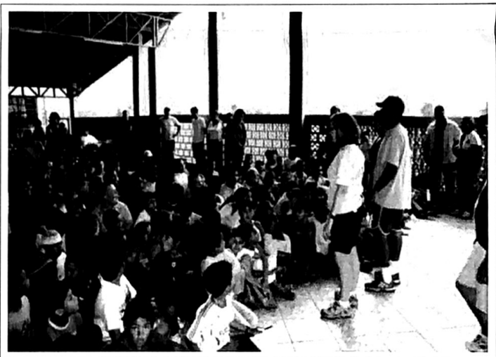
Virginia Beach mission group making a presentation at a public school.