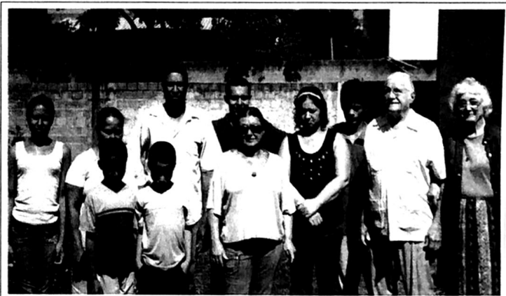
Eight persons baptized: Six from Assai, one from Rancho Allegro and one from Urai Baptist Church.