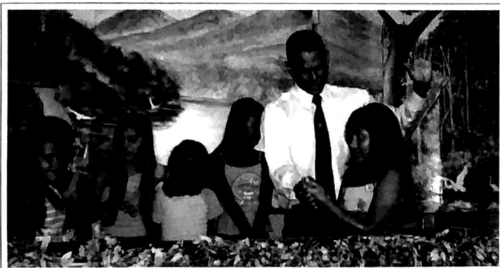
Baptism at First Baptist Church.