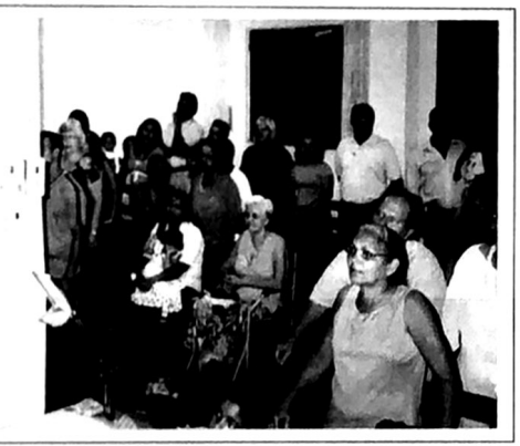
Special service to commemorate the new pastor's "taking the pulpit" at the Altos do Coxipo Baptist Church.