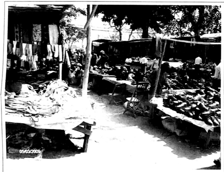
A trip to the marke

license and this on top of the fact that he couldn't pay it in the first place. As you can see, the corruption is deeply rooted here. I could go into more detail but this will suffice.