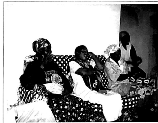
Visiting with a family in their home.

Second, one of the village churches I work with here has had some conflict between the members. There have been power struggles where members are striving with the pastor. These are completely common things that happen whether you live and attend a church in Kenya or live and attend a church in America. The difference comes in this way: If you were a pastor would you worry or even think