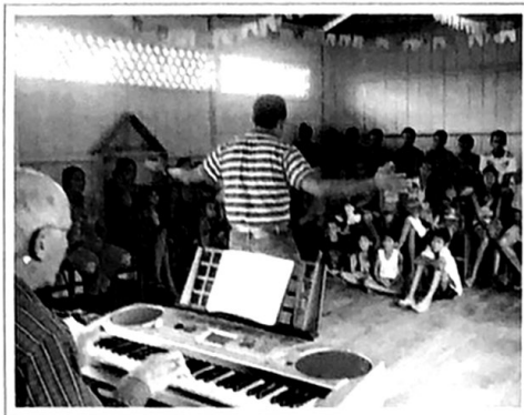
Visiting the work at Sao Salvador.