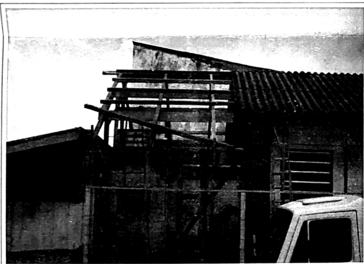
Picture of the construction of the new classroom at the Diadema Baptist Church.

The addition of a classroom for children at the Diadema Baptist Church has been nearly completed and we are thankful to those who contributed to this cause. Please see the pictures provided of the construction process of that classroom. There are three new candidates for baptism at that mission work.