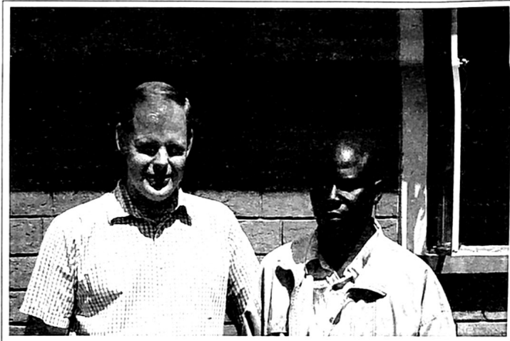
Standing outside with a former prisoner who assisted me in the ministry at the prison.