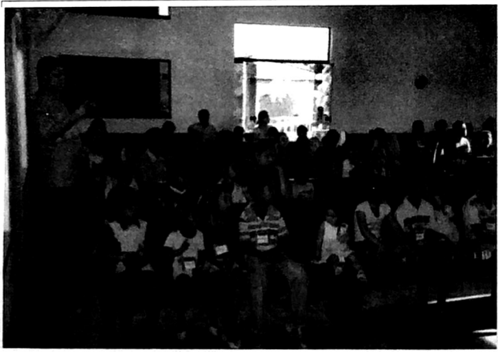
Those who attended our Vacation Bible School.