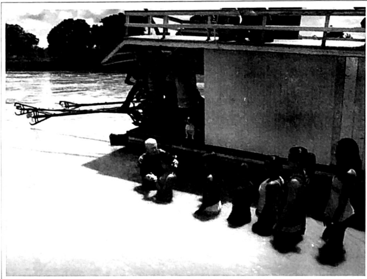
Baptism at Thaumaturgo.