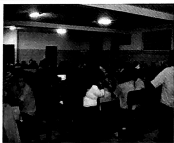
Friendship supper at Alpha and Omega.