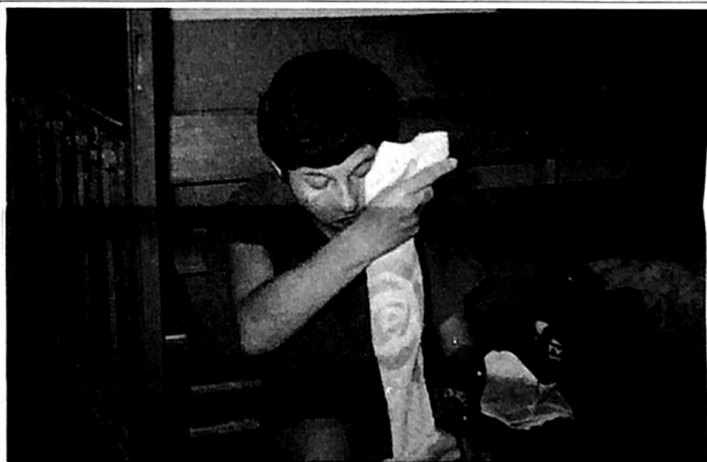
This young lady has to be carried and placed on one of the church benches and can only speak a few words.