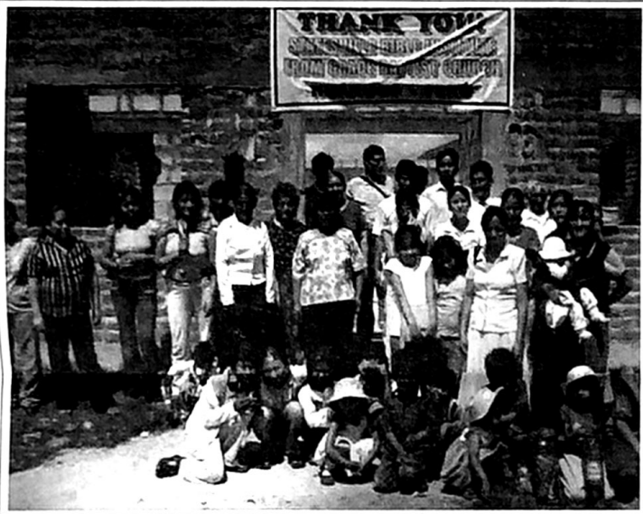
Members of Grace Baptist Church thanking the Statesville Bible Institute.