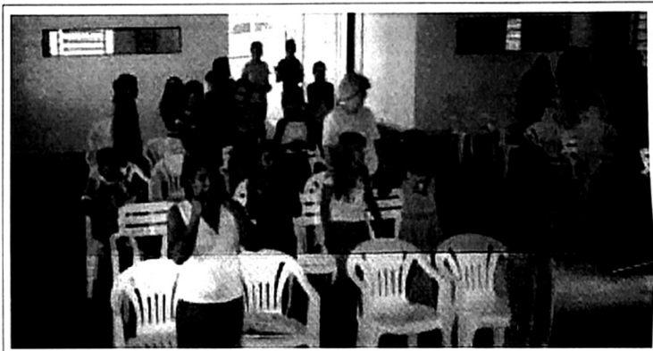
Sunday School for children at the Baptist Mission in Primavera do Veste.