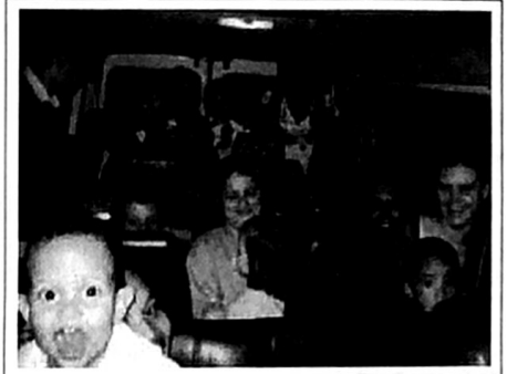
Van that took our people home after the bus broke down.

The work at the Vocational School is at a temporary standstill as we are putting all our efforts into getting our home finished for us to move into in two weeks. We are painting, cleaning, repairing walls and floors. Pray for us as we complete this and move our furniture and belongings to the new home. Sometimes you don't realize how much you have until you move.