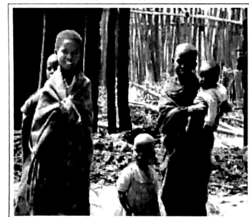
Kenyan village and some of those that need your prayers.

Even though there are so many challenges with missions, we know God has called us and we desire to be used by Him. Matthew 11:29 comforts us, which says, "And every one that hath forsaken houses, or brethren, or sisters, or father, or mother, or wife, or children, or lands, for my name's sake, shall receive an hundredfold, and shall inherit everlasting life." We know that there is always a cost for following the Lord, whether in the States or overseas. True discipleship is costly, as Luke 9:23-24 says, "And He said to them all, if any man will come after me, let him deny himself, and take up his cross daily, and follow me. For whosoever shall save his life shall lose it: but whosoever will lose his life for my sake, the same shall find it."