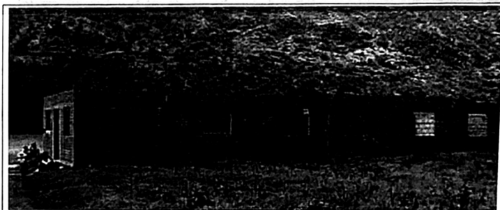
New construction of the Grace Baptist Church in Huanuco, Peru.