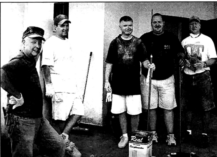
Workers from Virginia Beach that helped out with the house that was purchased.