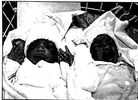
Twins in the premature nursery wearing items donated from our faithful churches such as hats, diapers and blankets.

We have struggled lately with tax issues here. We have paid taxes here and in the U.S. for eight years now, and have a tax accountant who advises us. We pay our taxes monthly, as well as our tax accountant. In July, we received notice that we were being audited. Our accountant wanted to meet with us personally about these issues, so we made several trips to meet with him, as he is an hour and a half away in the nearest city to Kitale. He advised us on how to meet with the tax authorities, so we met by ourselves the first time as our accountant didn't want to go. Unfortunately, they had many questions that we couldn't answer. The authorities are bearing down on tax payers in the hopes of increasing taxes. Our accountant called the authorities and made an appointment for us this week to go in again to talk to them. When we arrived, we were told that the main person had malaria and would be out on sick leave for the rest of this week. No one else was able to meet with us. So, it has been very frustrating and stressful, as we have been faithful to pay our taxes. We were being audited, but were not told about all of the information that was needed from us. We have learned new information each time that we have met with our accountant, as well as the tax officials. So, nothing has been settled, although our accountant told us that we need not worry, as we are not in a business and make no money in this country.