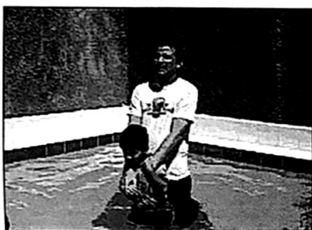
Assistant pastor's son being baptized.