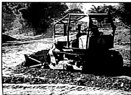
Clearing the back of the land.