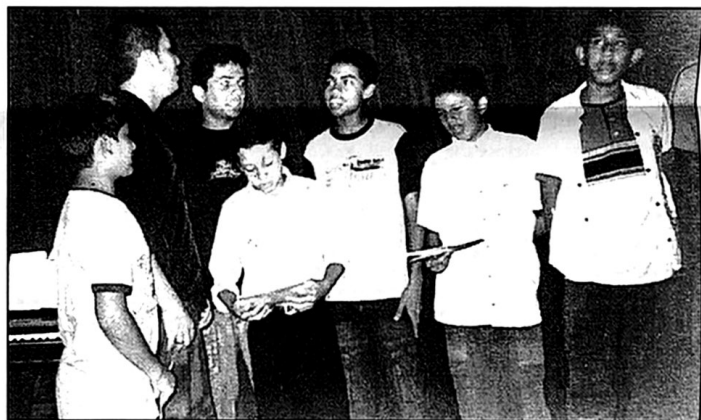
A group of young boys singing after Sunday School at the 24th of March Baptist Church.