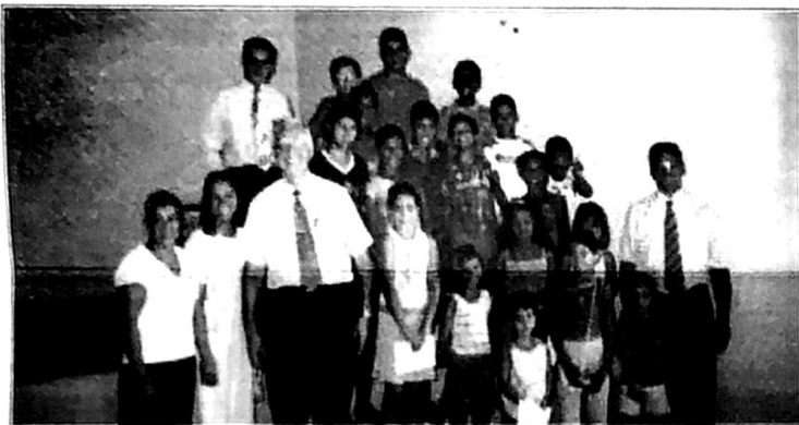
Sunday School group at the Baptist Mission in Primavera do Leste.