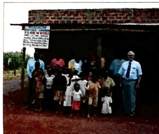
The Wanachi Baptist Church.