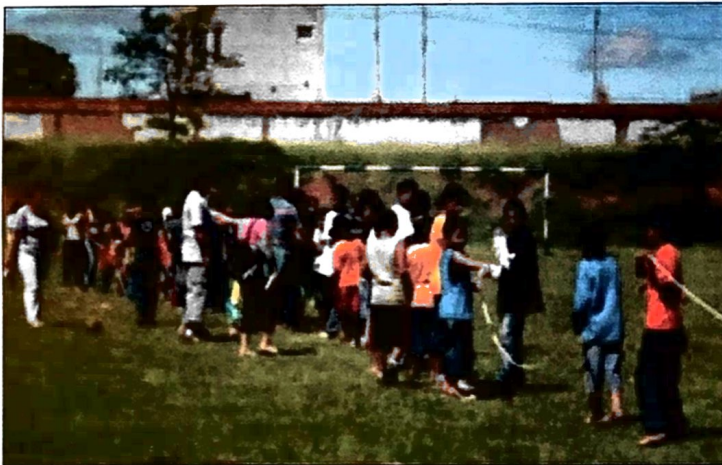
Activities for the children at the church.