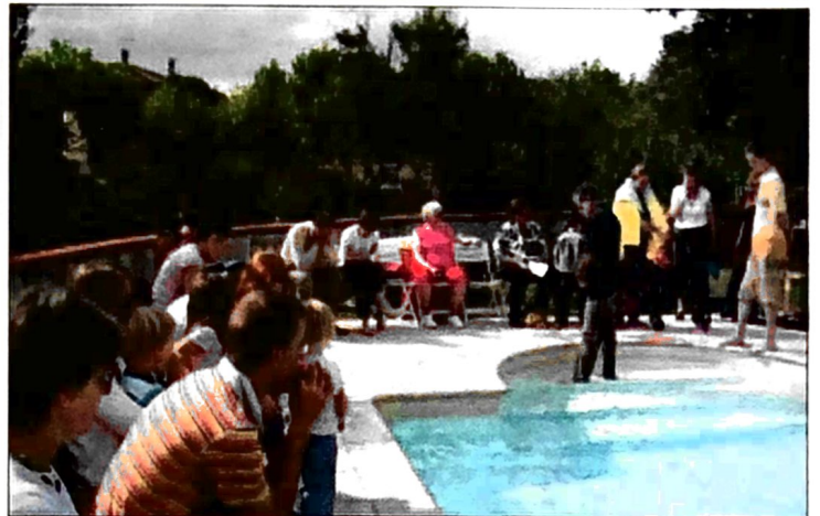
Crowd present for baptism in Southern France.

The ladies helped the first day in the morning and then in the afternoon we held a Bible School in the