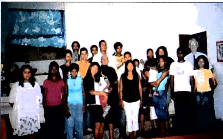
Sunday night crowd at the Jardim Fortaleza Baptist Mission. This work is in the most violent neighborhood of the city. It is a very needy place both materially and spiritually.