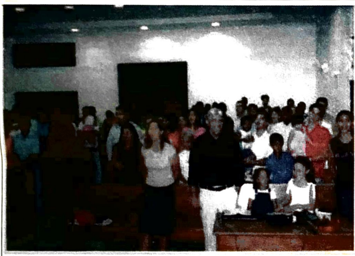
Sunday night crowd at Boa Esperanca Baptist Church for a baptismal service.