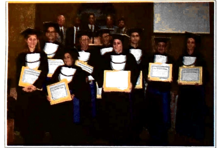
First graduating class of our Seminary at the New Life Baptist Church in Caraguatatuba

phone: 011-5512-3888-4189 How AWESOME is the God we serve. Present at this graduation ceremony was five more students that are in the process of completing the four-year program. We are looking forward to the next graduation and these five receiving their diplomas. We were able to get donated the caps and gowns for the service and everything went well and all looked very official. We are praying for more students for the coming years. This will greatly enhance the ongoing ministry here in Caraguatatuba. Pray for us as we continue in this training endeavor.