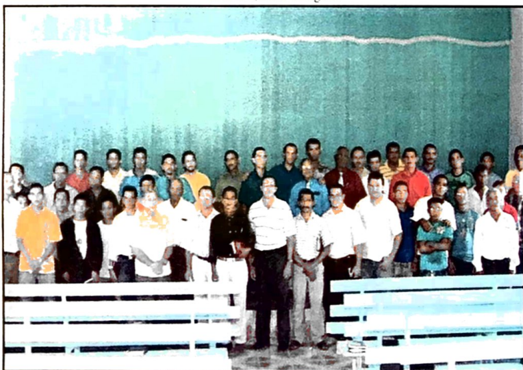
The almost fifty preacher's that attended the meeting at Barao.