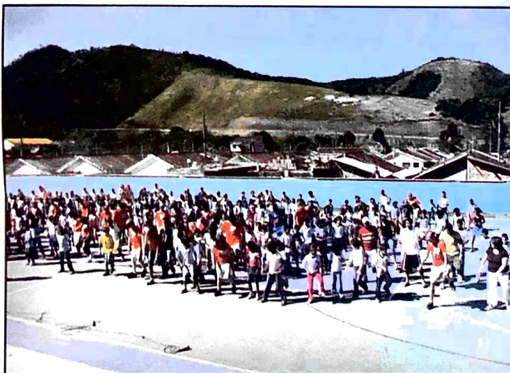
The group that was here this month presenting their program and the gospel and the children interacting.

We have two types of schools here in our area: State Schools and City Schools and they are governed by two different groups. The city schools are very reluctant to let us come to their schools because for the most part they are governed by Catholic principles. But, this year we had a teacher in this one school that talked the principle into letting us come and the response was overwhelming. We were invited to the morning and the afternoon sessions and also to have lunch with the teachers. It was AWESOME. In the morning session we had such a great response to the invitation that we could not talk to each individually so we got into groups and each group reiterated the message