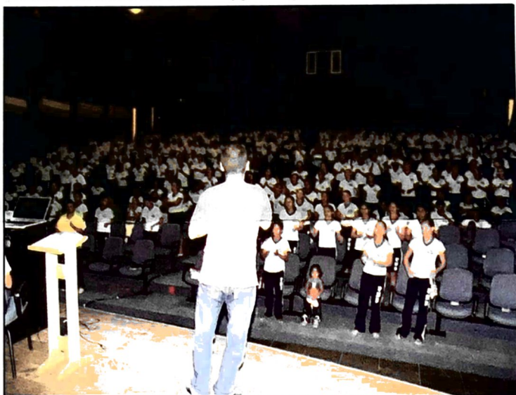
Special services at the local high school where over 1,500 teens heard the gospel.

I preached for the first time this past Sunday night. We had a big rain all afternoon and into the night. We still had over 700 in services. That is a really great change that has been happening over the past few